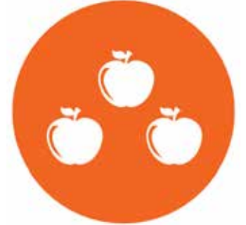
Determine your guidelines for healthy living