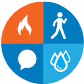
Use the Hot, Walk & Talk strategy