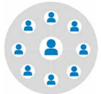
Cultivate social support at work and at home