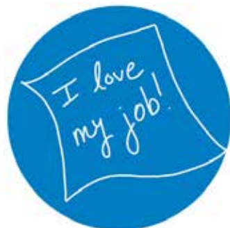
Compassion Satisfaction: Remember the rewards of your work