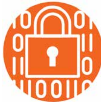
Try a Digital Detox