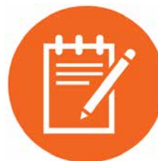
Create an action plan & remain accountable