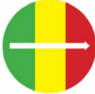
Monitor your warning signs