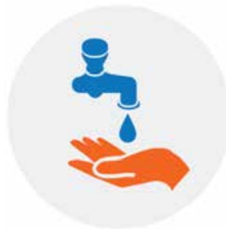
Use Low Impact Debriefing when necessary