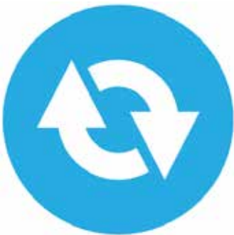
Reset: before, during & after exposure