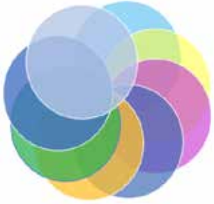
Understand multiple points of exposure