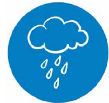
Don't be afraid to "Disappoint Someone Today"