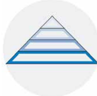
Establish your personal Balance Map