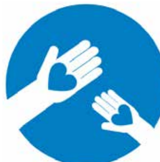
Become trauma-informed & know your ACES