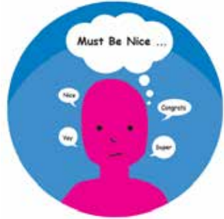
Recognize your "Must Be Nice" reactions